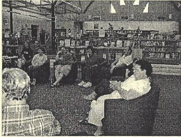
Adults and teens enjoy a program about a fellow community member's hike along the Appalachian Trail.

For Red Jacket Community Library, I would say that 2009 was the year to really begin to assert some independence. Although this library may never be fully independent of the school, nor may the residents of the school district wish it to be, there have always been certain limitations which have come along side of the very obvious benefits of the shared facility.